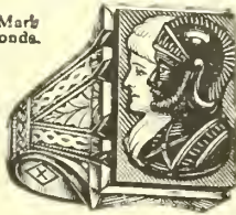
No. 6746 Exact size of ring $24

Dept. AL (or at your Jeweler's) 501 Washington St., Buffalo, N. Y.