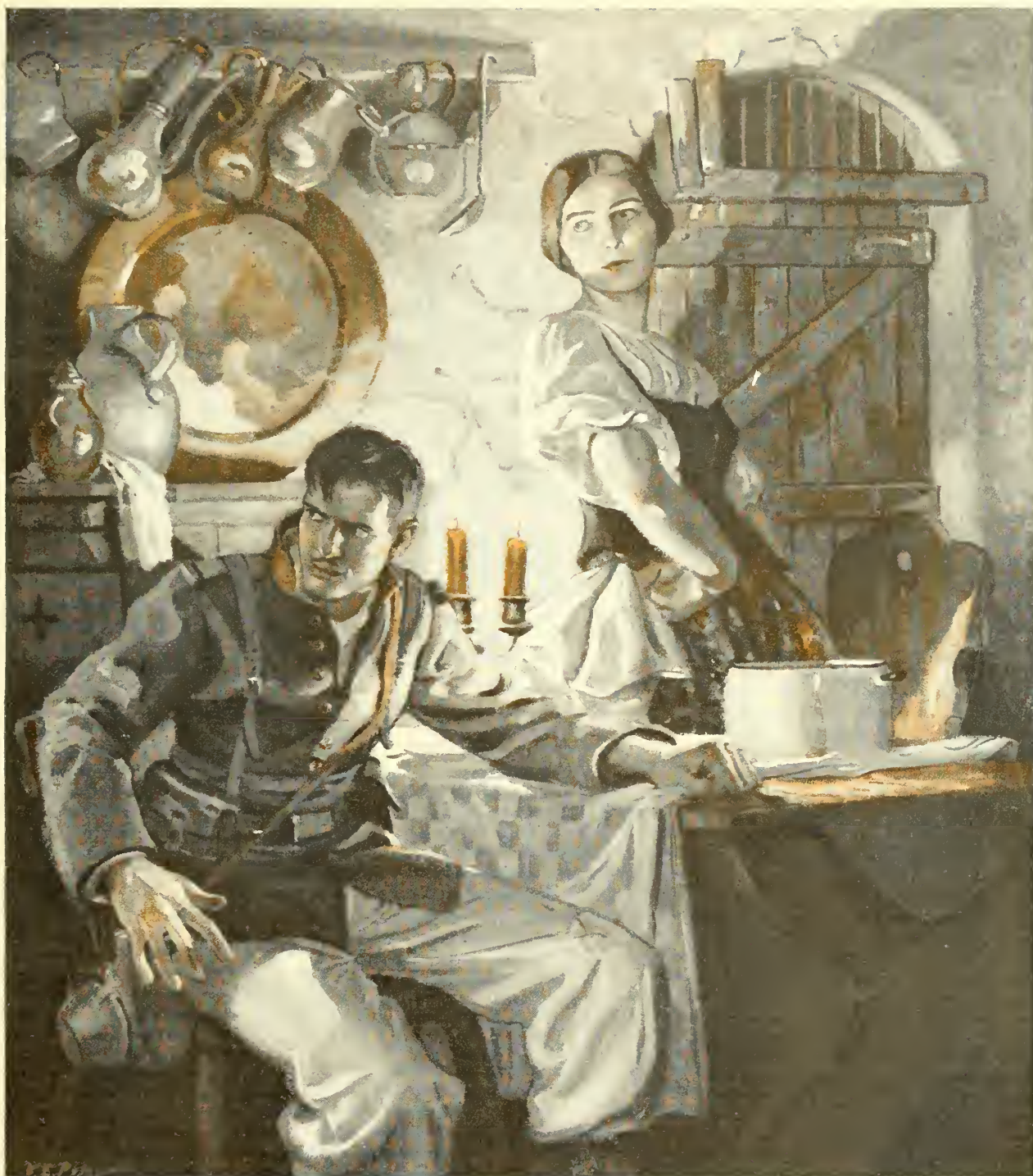
A series of loud strangling groans from an adjacent room whose door stood ajar startled him into action

"What is that?" he cried, half afraid that he was being trapped. The girl half-smiled at his fear. "It is only the gross mütterchen—grandma," she answered. "She is old and ill and she always does that. Sit down again and eat."